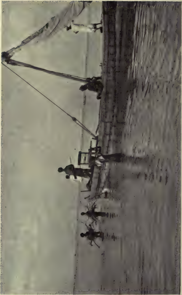
A GOVERNMENT CHARTERED DHOW, ZEILA.